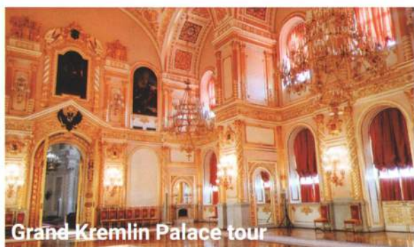
Grand Kremlin Palace tour