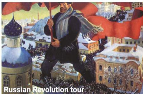
Russian Revolution tour

Our wide selection of Moscow Tours include visits to the Grand Kremlin Palace, the Bolshoi Theatre, the Chocolate Factory, Moscow Film Studio, Stalin's Bunker and specialized Russian Revolution and Soviet Moscow tours, as well as many others. We can also cater tours to your specific requests.