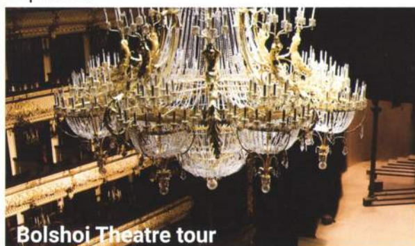
Bolshoi Theatre tour

Our wide selection of Moscow Tours include visits to the Grand Kremlin Palace, the Bolshoi Theatre, the Chocolate Factory, Moscow Film Studio, Stalin's Bunker and specialized Russian Revolution and Soviet Moscow tours, as well as many others. We can also cater tours to your specific requests.