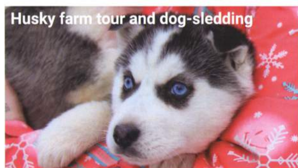
Husky farm tour and dog-sledding